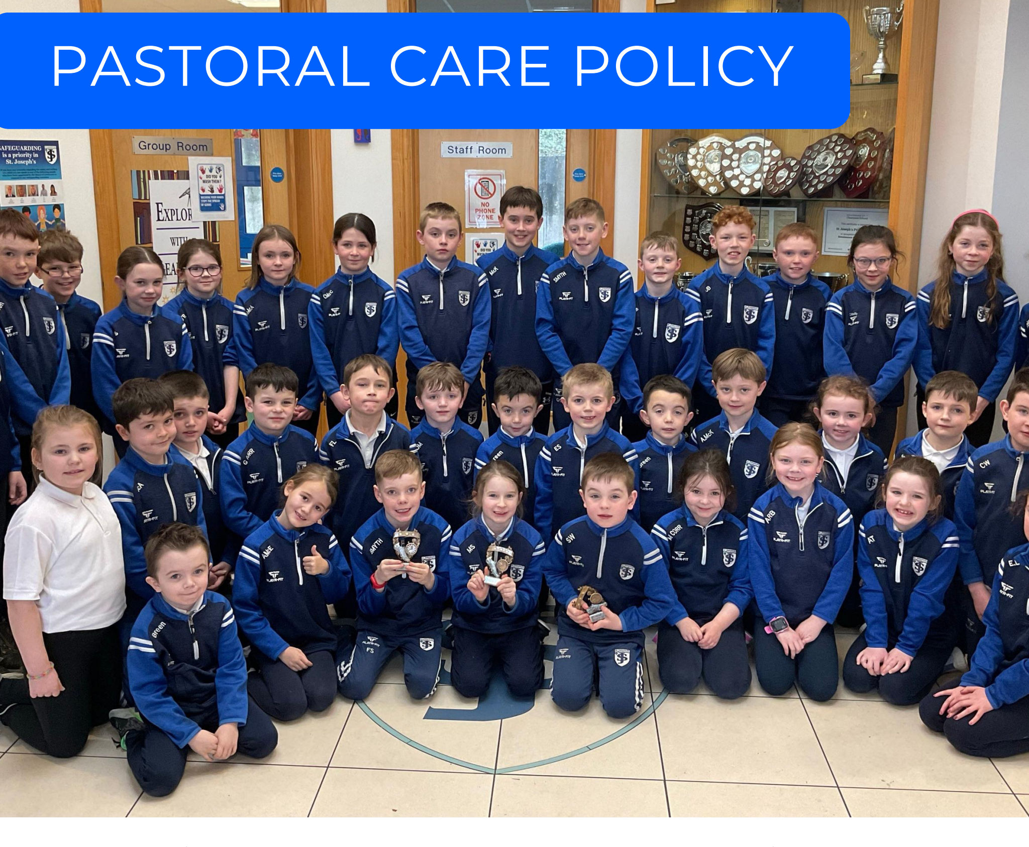
At St. Joseph's Primary School, pastoral care permeates all aspects of school life.

It reflects the values, attitudes, beliefs and practices of our Catholic faith and involves all members of our school community – Board of Governors, teachers, children, parents and all other adults who contribute to the well being of each child. We encourage pupils to discuss issues of concern that they may have through class Circle Time activities and also through our effective Kidscape programme. St. Joseph's Primary school is a caring, responsible school with the children at the core of our activities. We strive to respond to the personal, emotional, social and educational needs of our pupils through our interaction with them in the classroom and beyond.